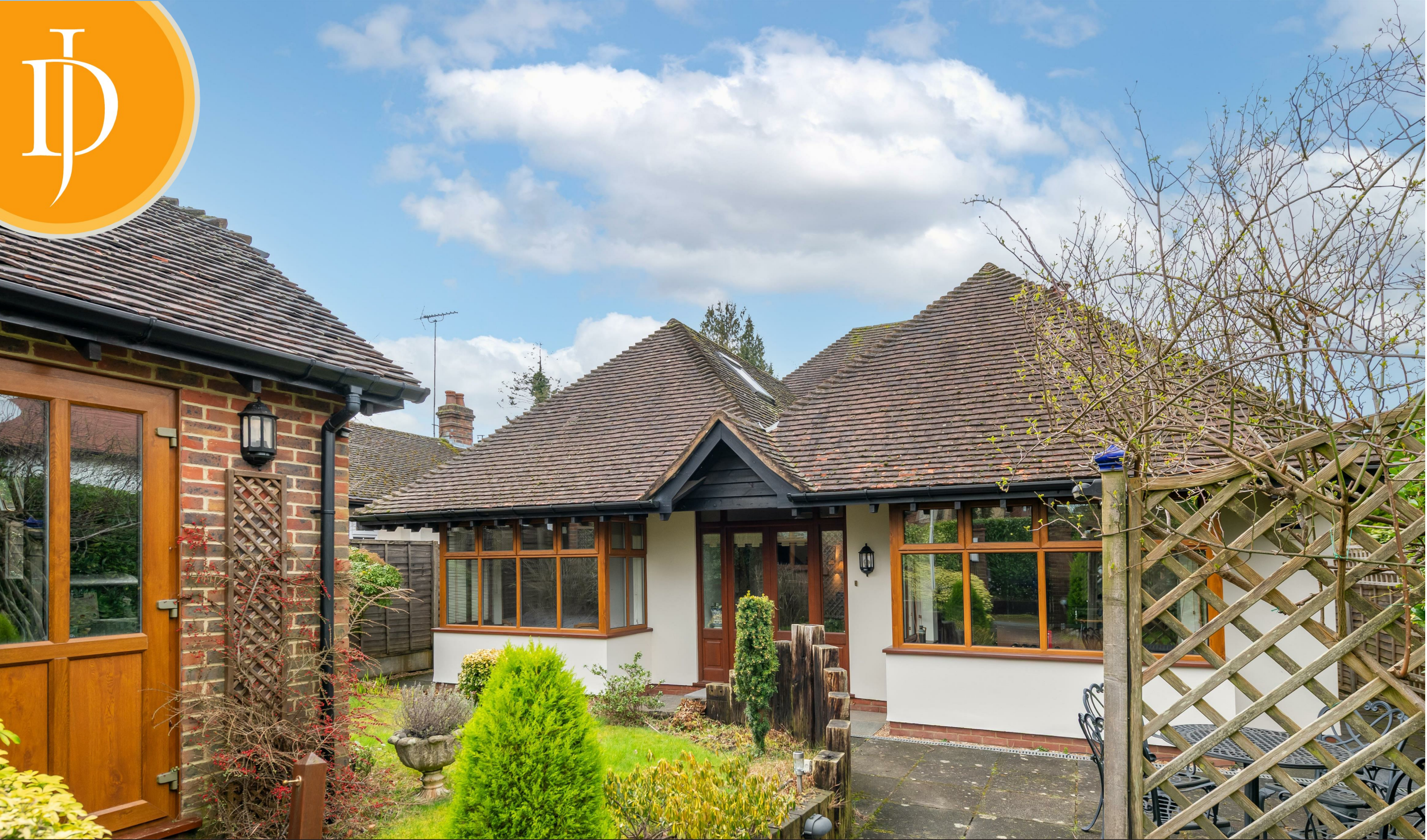
The Haven, Church Road, Worth, Crawley, RH10 7RS Asking Price £875,000